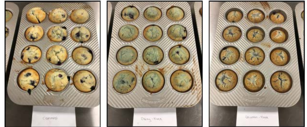
From left to right: Control, Dairy-Free, and Gluten-Free